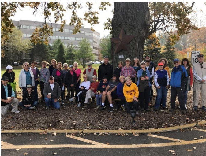
CHC members on the Moses Cleaveland Trees hike (in late October 2019) pose with a 283-year-old White Oak tree on the Travel Center of America property in Westlake.